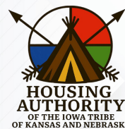
Campbell Housing Complex