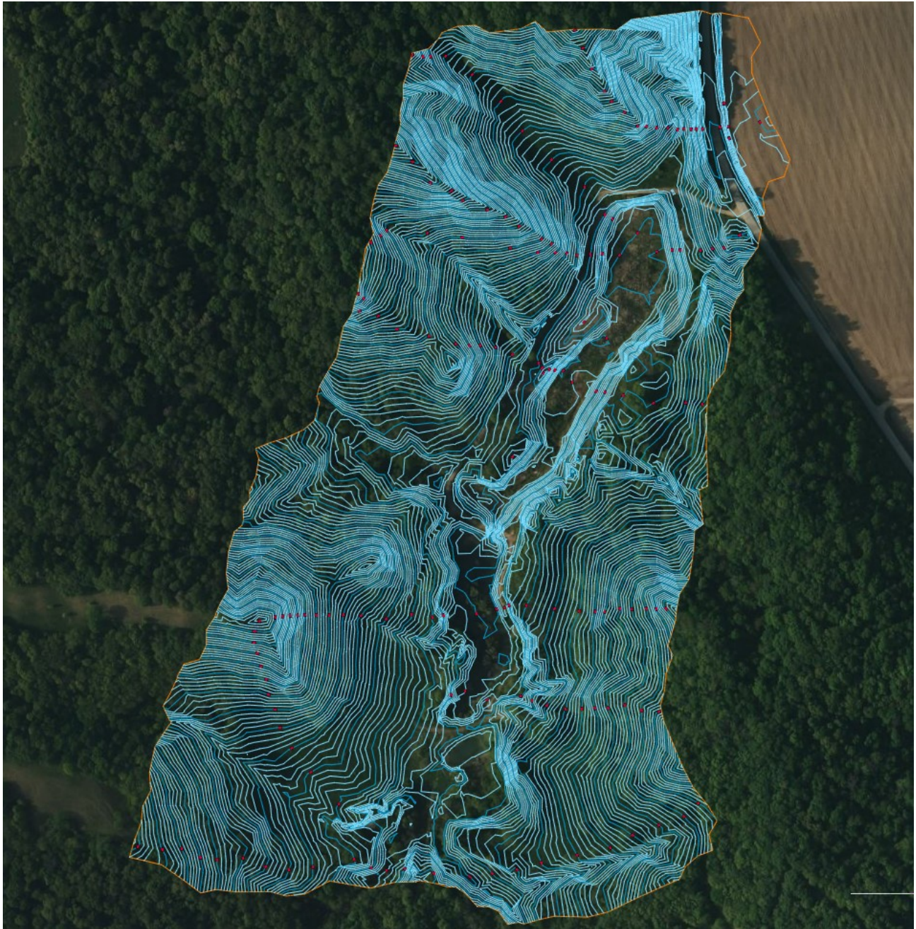
EXHIBIT 'C' TOPOGRAPHICAL SURVEY

The topographical survey PDF, AutoCAD file, and high resolution aerial photographs are available via the project file portal at: